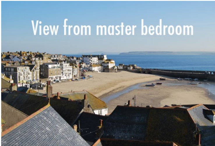
View from master bedroom